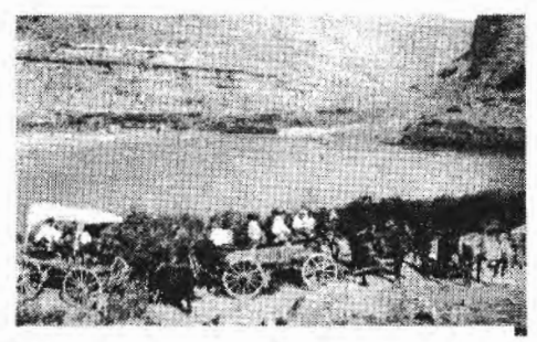
Early Hwy 128. Salt Wash across the Grand (Colorado) River.