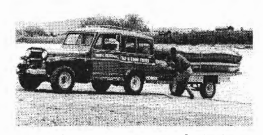
Tag-A-Long was operating raft trips in the 1960s. Photo of Mitch backing a trailer in the Green River.